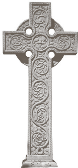
Markers and crosses incorporating art with a Celtic influence can still be found in the British Isles

Some researchers believe that the genes associated with the AMH moved with the early Celtic migrations. Although ancient ancestral Celts were a diverse group and varied in many ways, certain mythologies are consistent throughout most Celtic traditions, despite geographic or tribal boundaries. More than 300 Celtic deities have been described, many of which are reflected in classic Roman counterparts. The god Lugh (or Lugus) may have played an important role among those deities. Folklore and storytelling has infused Lugh's character with magic and fantasy, given him credit for thunder and lightening, and placed his stage in the sky.