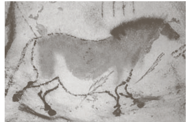
A cave painting from the French Lascaux caves which contain 16,000-year-old Paleolithic art.

You belong to haplogroup R1b , The Artisans, who first arrived in Europe from west Asia about 35,000-40,000 years ago at the dawning of the Aurignacian culture. This cultural was remarkable for its subtle yet significant technological progress, like the shift from